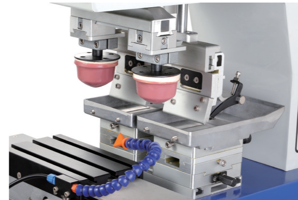
▲ 油盆结构 Open Tray Structure

* "C"为穿梭工作台系列, "A"为输送带工作台系列。"C" represents the shuttle workbench series, "A" represents the conveyor belt workbench series.