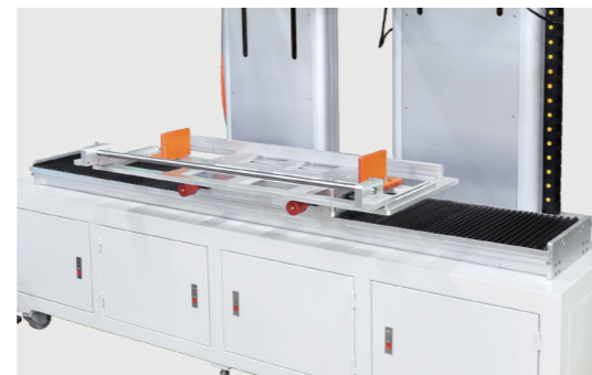
▲横向跑台 Transverse Workbench