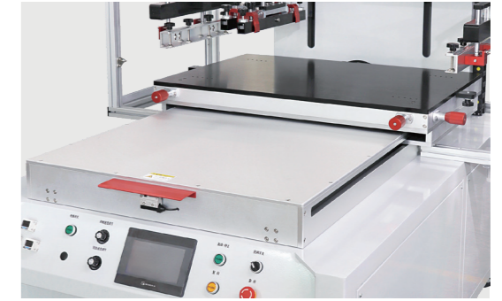
▲跑台工作台 Rotary Table Workbench