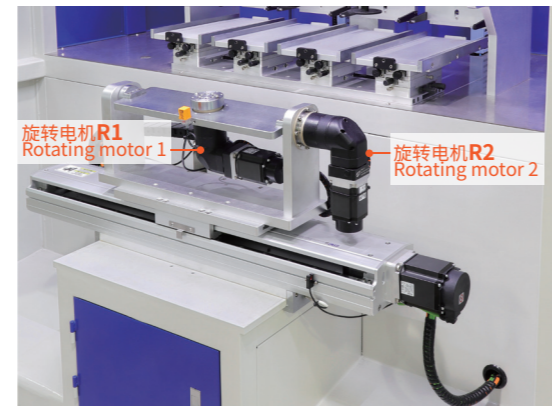
▲ 伺服旋转工作台 Servo Rotating Worktable