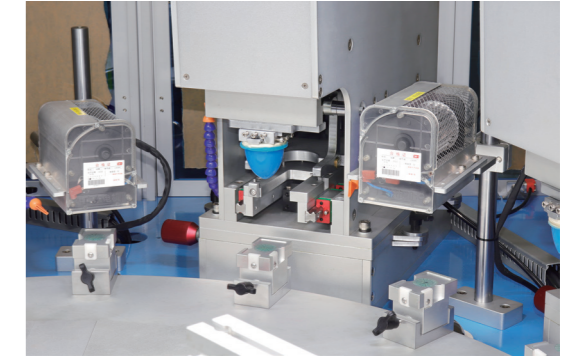
▲ 印刷系统 Printing System