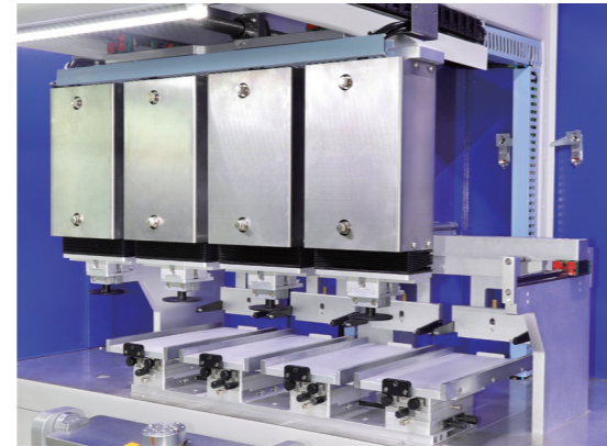
▲ 印刷系统 Printing System