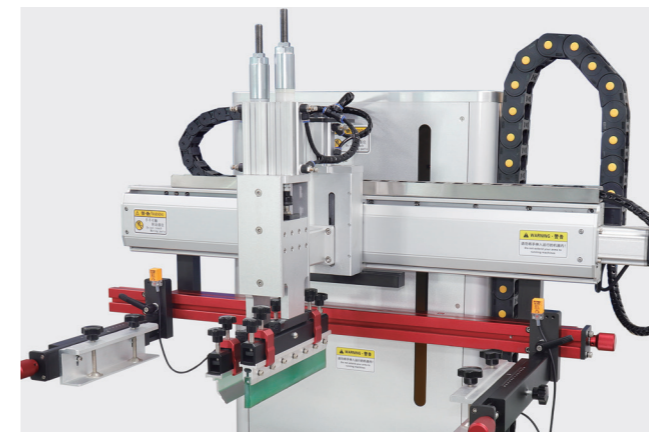
▲ 伺服印头 Servo Print Head

* "C"为转盘多工位工作台款式。"C" is the style of turntable multi station workbench.