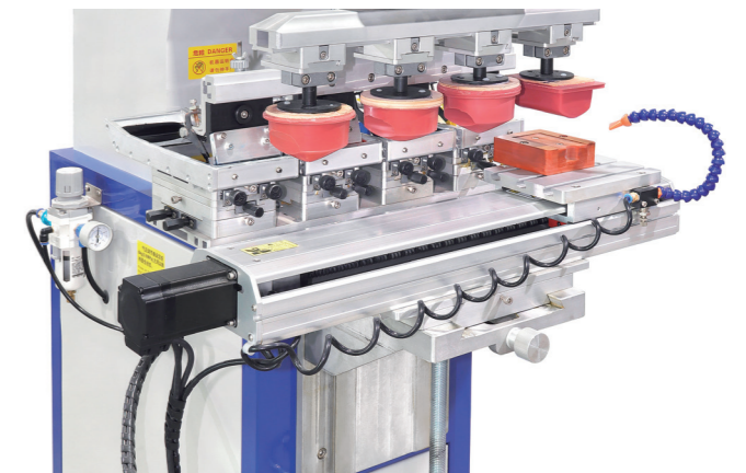
▲ 穿梭工作台 Shuttle Workbench