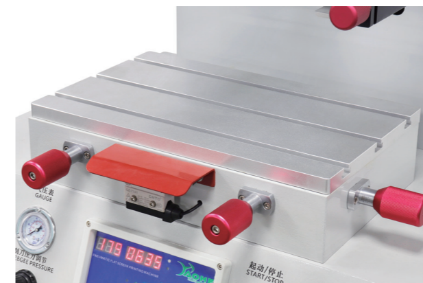
▲ T型槽工作台 T-groove Workbench

* “F”为T型槽工作台款式，“V”为吸风工作台款式。“F” is the T-shaped groove workbench model, “V” is the suction workbench model.