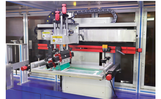
▲ 印刷系统 Printing System