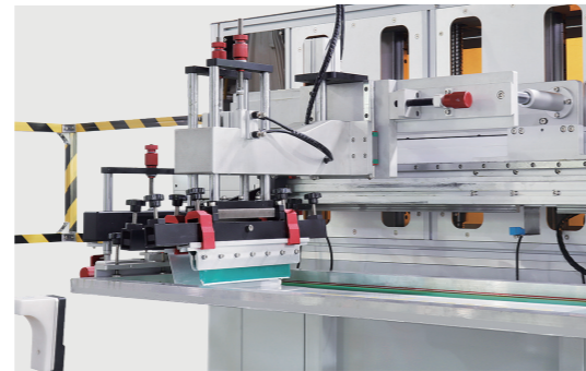
▲ 印刷系统 Printing System