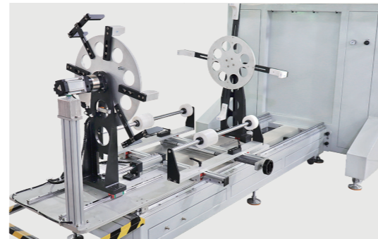
▲ 模组工作台 Module Workbench