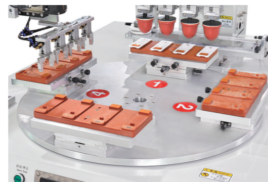
▲ 转盘工作台 Rotary Table Workbench