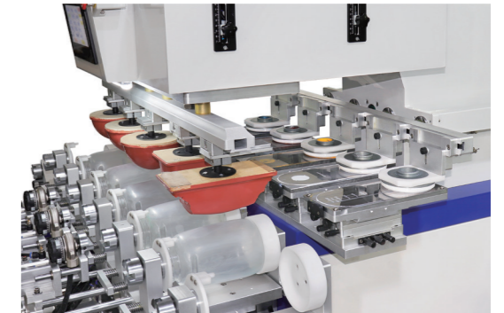
▲ 印刷系统 Printing System