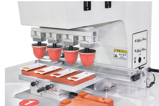
▲ 印刷系统 Printing System