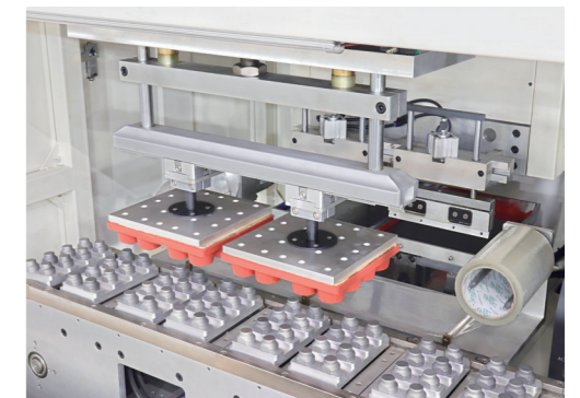
▲ 印刷系统 Printing System