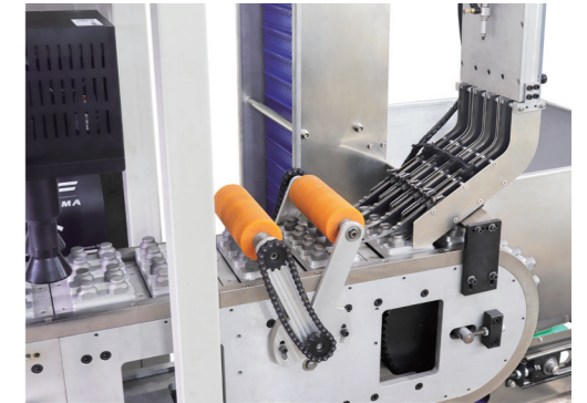
▲ 上料系统 Loading System